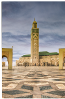
CASABLANCA Departure city

Small group of a minimum of 2 people up to a maximum of 4 people.